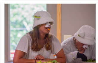
↑ Sheep Pictured Left to Right: Bonita, Betsy, Braveheart, Bob/Wolfredo